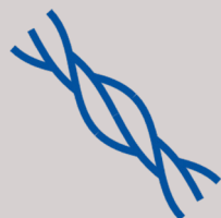
Cem Flex 8mm