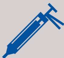
Bond Flex Gun Kit