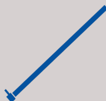
Cem Flex Nozzle & Cem Flex Insertion Tool